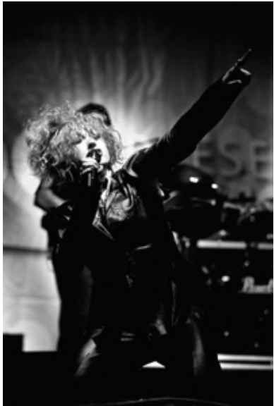
Tanja-Tiziana Cyndi. 2010, c-print, 12"x18" framing courtesy of O'Connor Gallery

Tanja-Tiziana's photography combines film and digital processes to explore the style and substance of past eras within our modern metropolis. You voted her one of the top two Toronto visual artists in Xtra's 2010 and 2009 reader polls.